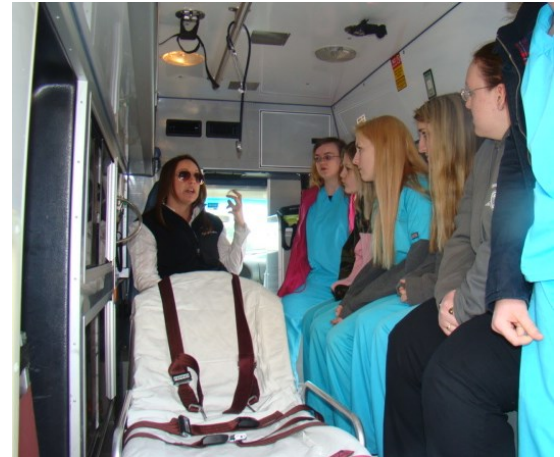
Above: Career Day—11th Graders in back of ambulance. Below: Viewing samples from microbiology.