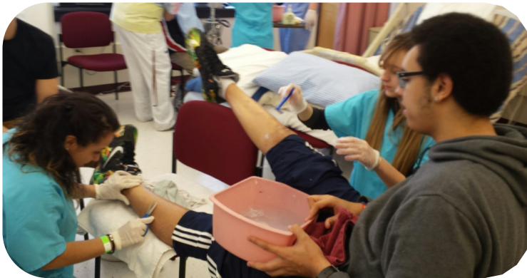
Above: Shaving Lab. Below: Seniors posing before CNA Exam.